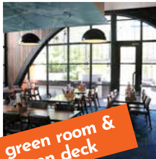
green room & green deck

For the best of both worlds, a Green Room Party can extend out onto the 'Green Room Deck' for combined inside-outside festivities. This also includes a private section of the bar to keep the good times flowing!