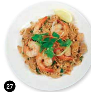
27 Pad Thai traditional flat noodles, chicken and prawns in tamarind sauce. N $19.80