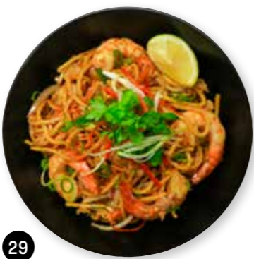
29 Mee Goreng egg noodles, chicken, prawns and sweet soy sauce. $20.80