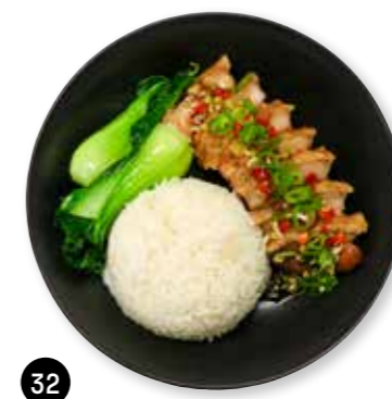
32 Crispy pork belly with Asian greens served with Jasmine rice. $25.80