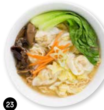
23 Prawn wonton soup with mushroom, cabbage and egg noodles. $18.80