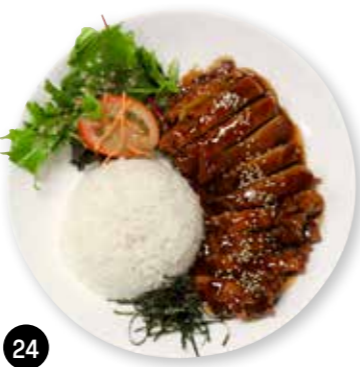
24 Teriyaki chicken served with jasmine rice. $19.80