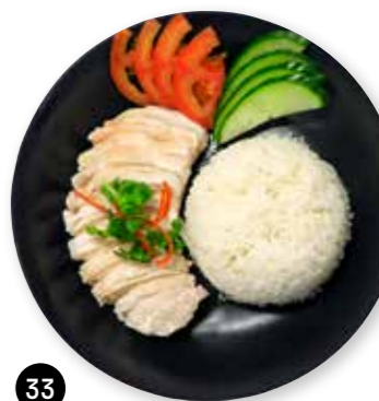
33 Hainanese chicken rice served with assorted condiments and broth and Jasmine rice. $25.80