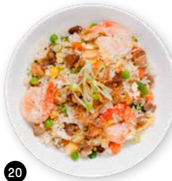
20 Yangzhou fried rice with prawns, BBQ pork, egg and vegetables. $19.80