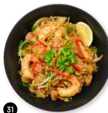
31 Char Kway Teow traditional flat rice noodles with prawns, chicken and spring onion. $21.80