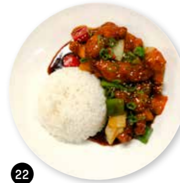
22 Honey Soy Chicken with capsicum and onion served with Jasmine rice. $18.80