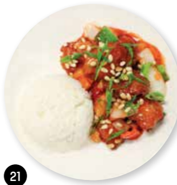
21 Sweet & Sour barramundi with pinenuts served with jasmine rice. N $17.80