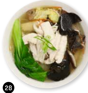
28 Chicken and vermicelli noodle soup with Asian greens. $16.80