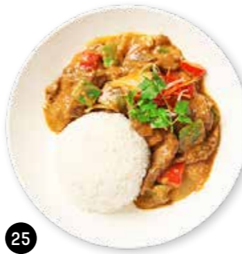
25 Wok fried beef in satay sauce served with jasmine rice. N $19.80